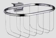
Soap basket Unica® # 42066,-000,-820,-830