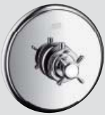
Thermostat for concealed installation Finish set # 16810,-000,-820,-830 Highflow thermostat T42 for concealed installation Finish set # 16815,-000,-820,-830