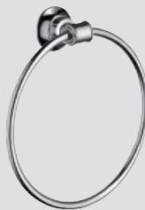
Towel ring # 42021,-000,-820,-830