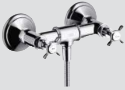
Twin-handle shower mixer for exposed fitting # 16560,-000,-820,-830