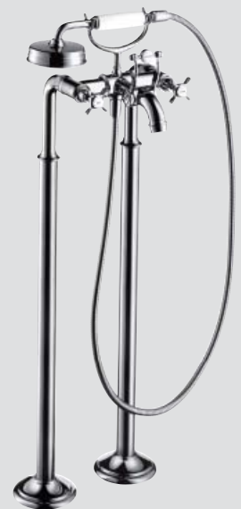
Twin-handle bath mixer for upright, floor- standing installation, with hand shower* Finish set # 16547,-000,-820,-830 Basic set # 16549180