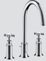
3-hole basin mixer # 16513,-000,-820,-830