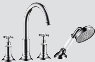
4-hole bath mixer for installation on the tub rim with hand shower* Finish set # 16546,-000,-820,-830 Basic set # 13444180