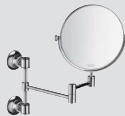
Shaving mirror, extractable # 42090,-000,-820,-830