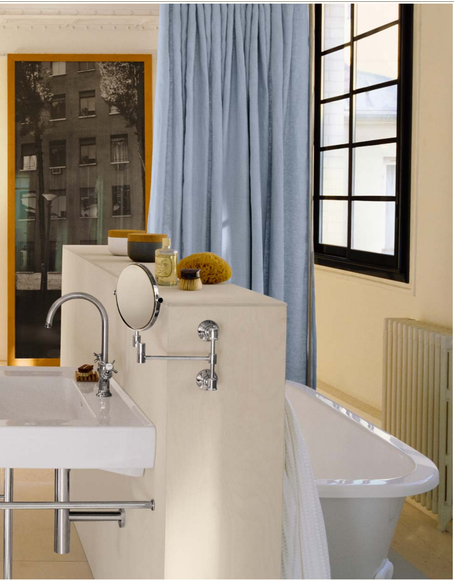
Back to the future. An intriguing thought – what was fashionable 100 years ago can still be fashionable today. This way, the entire Axor Montreux bathroom collection significantly enhances a contemporary style mix.