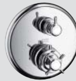
Thermostat with shut-off valve and diverter valve for concealed fitting Finish set # 16820,-000,-820,-830