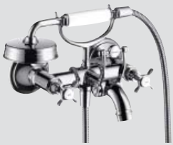
Twin-handle bath mixer for exposed fitting with hand shower* # 16540,-000,-820,-830