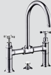
Twin-handle basin mixer # 16510,-000,-820,-830