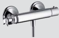
Shower thermostat for exposed fitting # 16261,-000,-820,-830