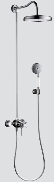
Showerpipe consisting of thermostat for exposed fitting, overhead shower 240 mm, hand shower*, flexible hose and shower support # 16570,-000,-820,-830