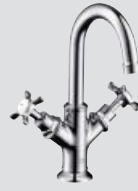
Twin-handle basin mixer for small basins # 16505,-000,-820,-830