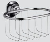
Soap basket wall mounted # 42065,-000,-820,-830