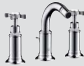
3-hole bidet mixer # 16523,-000,-820,-830