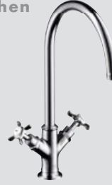
Twin-handle kitchen mixer # 16802,-000,-820