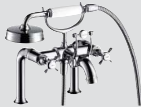
Twin-handle bath mixer for installation on the tub rim with hand shower* # 16542,-000,-820,-830