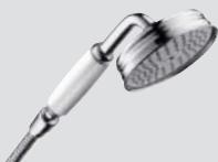
Hand shower* # 16320,-000,-820,-830