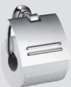
Roll holder # 42036,-000,-820,-830