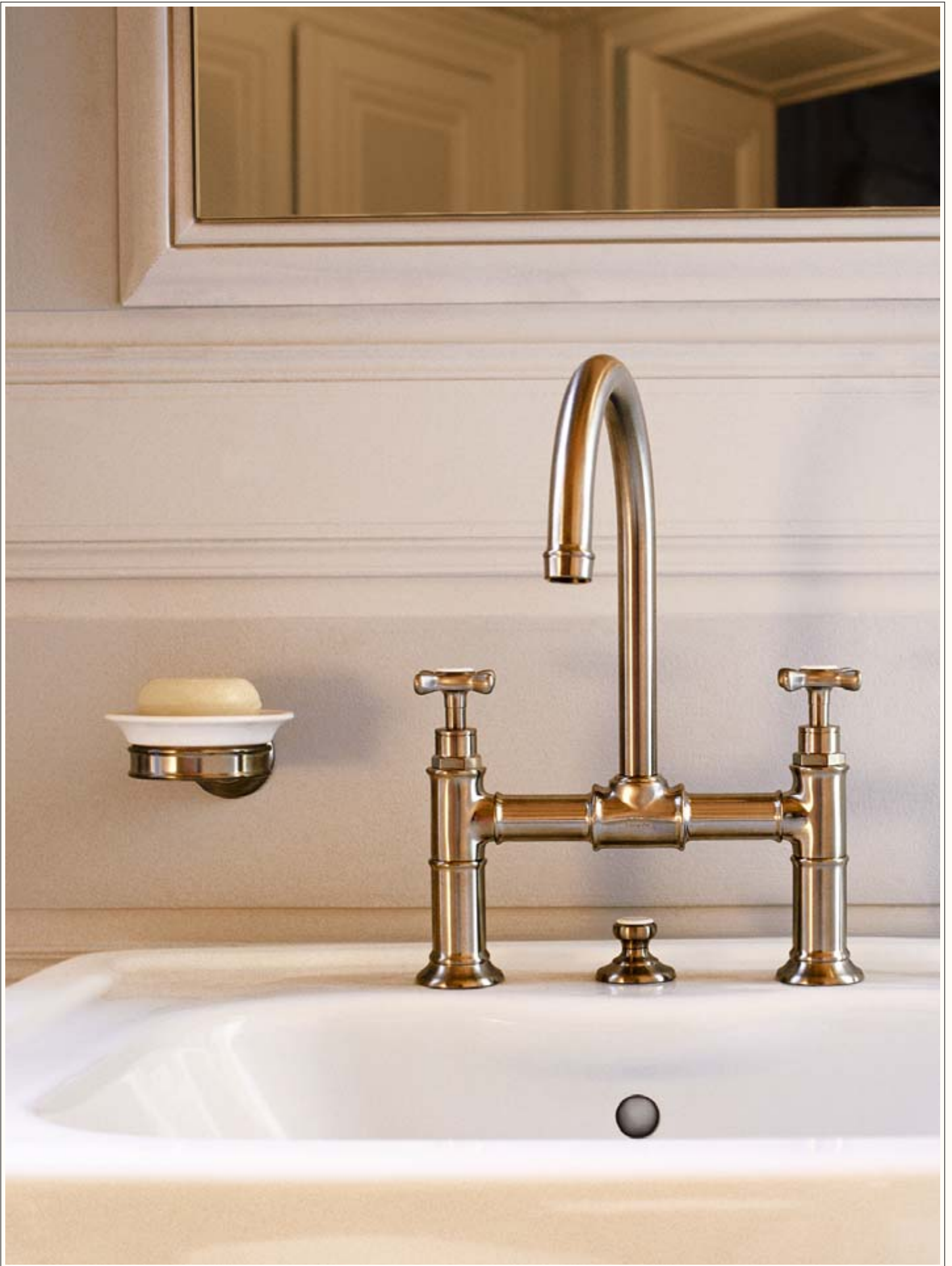
The bridge to traditional bathroom design. Besides the bridge fitting, a variety of other wash basin mixers awaits the user.