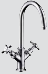
Twin-handle basin mixer # 16502,-000,-820,-830