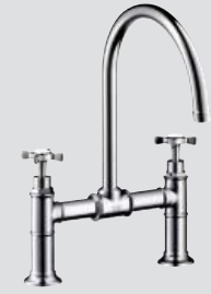
Twin-handle kitchen mixer # 16803,-000,-820