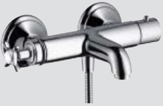
Bath thermostat for exposed fitting # 16241,-000,-820,-830