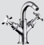
Twin-handle bidet mixer # 16520,-000,-820,-830