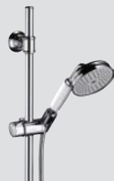
Shower set with hand shower* # 27982,-000,-820,-830