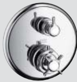
Thermostat with shut-off valve for concealed fitting Finish set # 16800,-000,-820,-830