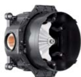
2000 iBox universal