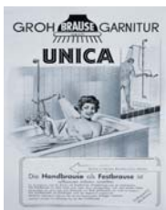
1953 Unica wall bar