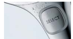
2013 – Hansgrohe Select technology