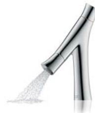
2012 Axor Starck Organic